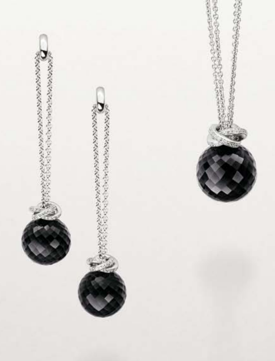
Orbit Allow the light to spin and dazzle.